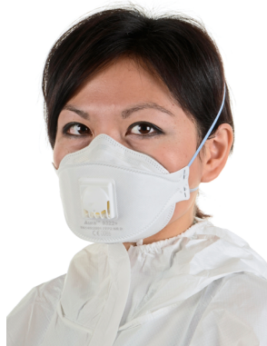
Figure 1 Disposable half mask

Examples of types of tight-fitting facepieces are shown in Figures 1, 2 and 3.