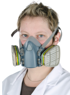
Figure 2 Reusable half mask