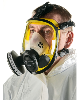
Figure 3 Full-face mask